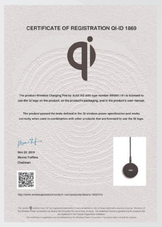
WPC's Certificate of Registration