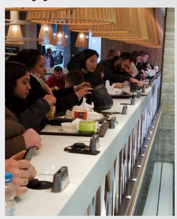
Source: WPC; Over 300 of McDonald's in the U.K. offer Qi wireless charging

To learn more about wireless charging and the Qi certification process, please contact Paul Golden, WPC vice president of market development, at +1 972.854.2616 or paul.golden@wirelesspowerconsortium.com.