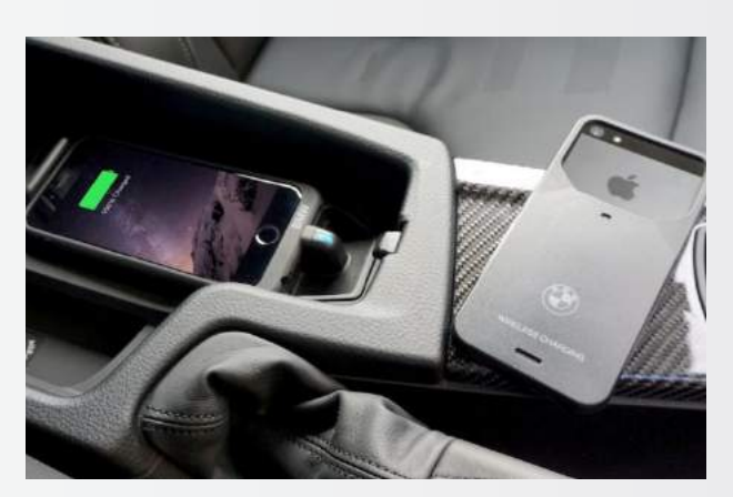
Automobiles such as BMW offer in-vehicle Qi wireless charging and branded products

From charging pads, to furniture to cars, Qi wireless charging is a simple, efficient and reliable technology used by millions of consumers worldwide.